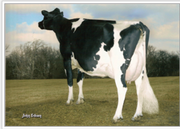
Nehls Bros Cadet 10123-Grade