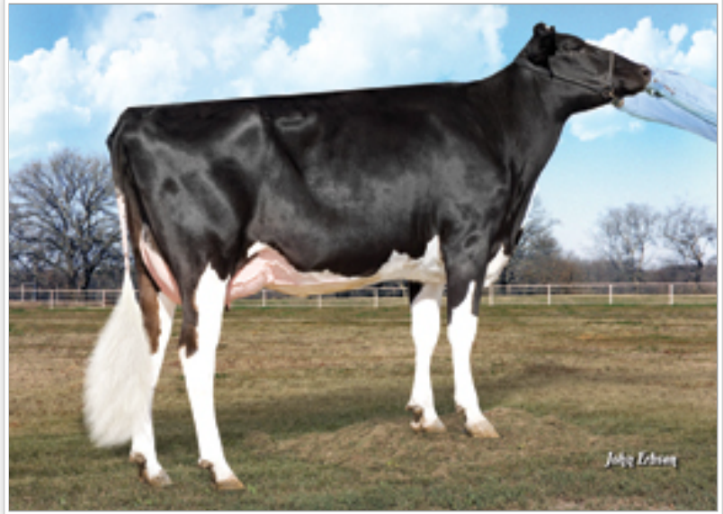
Cross Canyon Cadet 8757