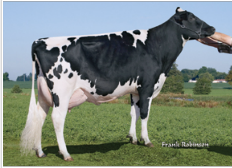
DAM Ri-Val Re Shtle Wendi-ET VG-88