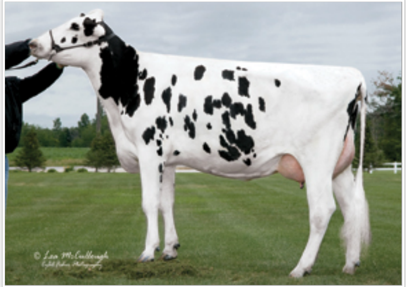
Country-Aire Cedric 5777