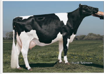
Creekside Cedric 403